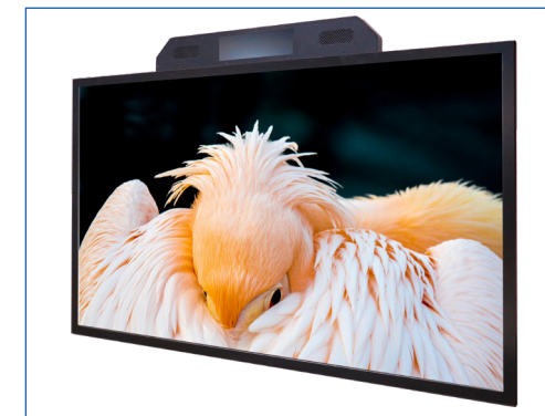
Monitor PLUS-Line 55 front view