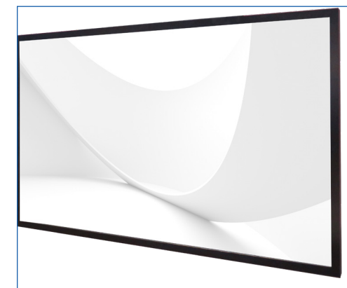
PLUS-Line 55 monitor without media bar