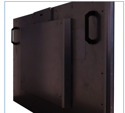
Backside and a view of small design of PLUS-Line 55.